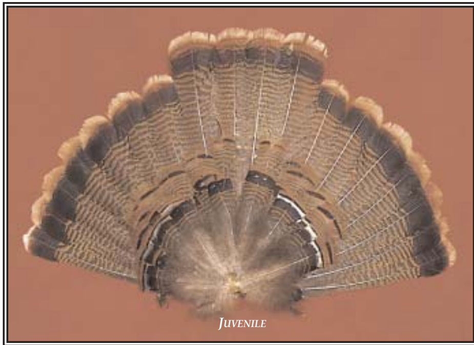
Juvenile – irregular contour of tail feathers