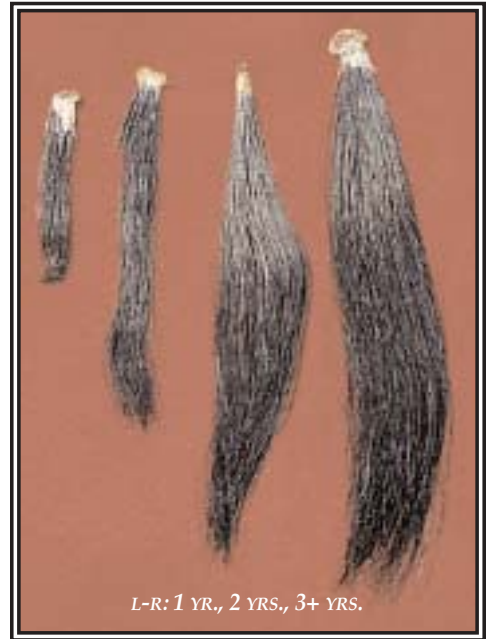
L-R: 1 YR., 2 YRS., 3+ YRS.