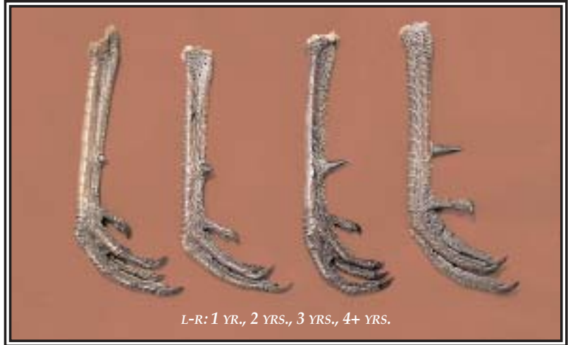
L-R: 1 YR., 2 YRS., 3 YRS., 4+ YRS.