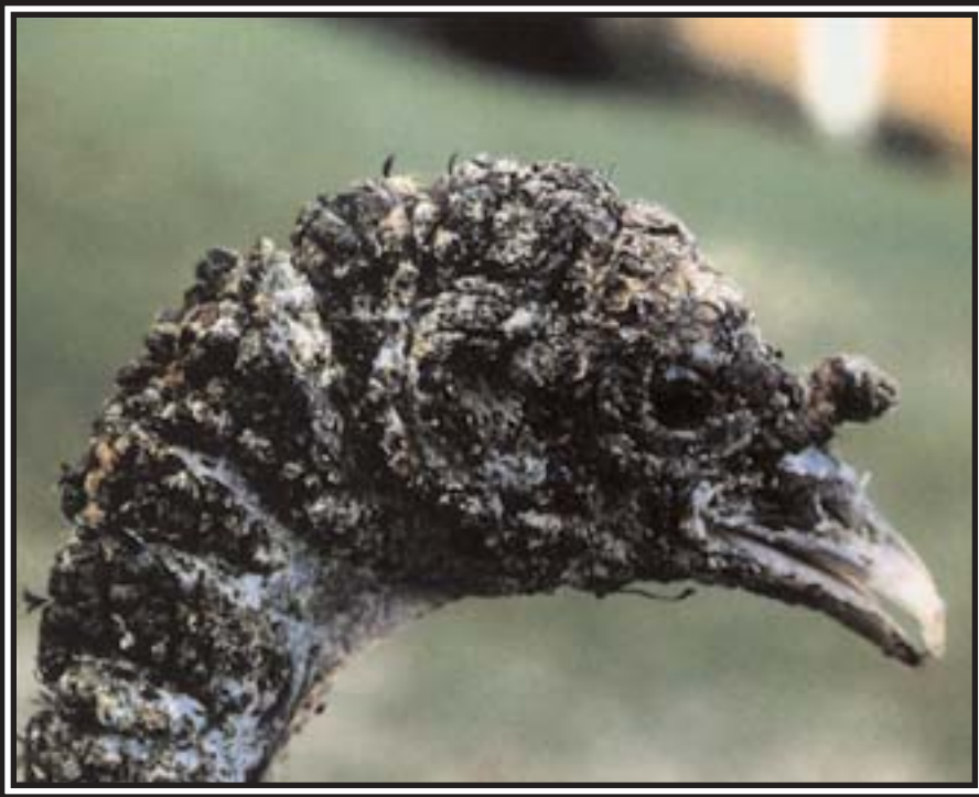
Proliferative nodular lesions on unfeathered areas of the skin are very characteristic of avian pox infections. Lesions often become abraded and scab-covered, as in this case.

The light-colored proliferative avian pox lesions depicted in the mouth of this turkey can cause debilitation or death. Wild turkeys may have either external lesions on the skin, internal lesions in the upper portions of the digestive and respiratory tracts, or both.