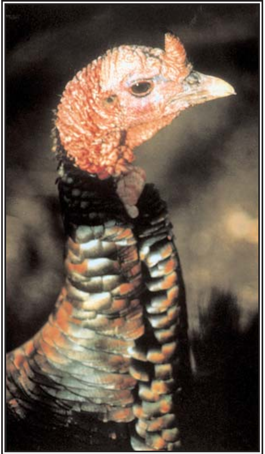
Close-up, a normal, healthy wild turkey gobbler's head is bright red and wrinkled.